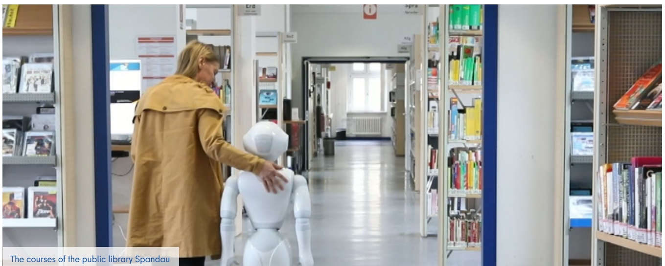
The courses of the public library Spandau

The ERDF-funded project "Digital Lokal" is part of the ZIS II future initiative and aims to promote attractive educational opportunities in socially disadvantaged districts. "Digital Lokal" contributes to supporting media literacy as well as the integration of citizens in Spandau.