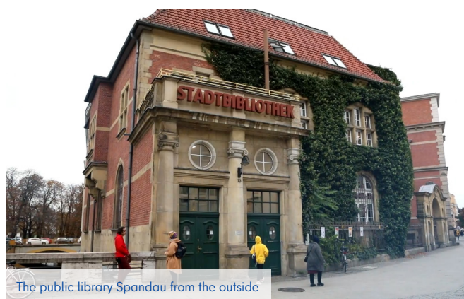
The public library Spandau from the outside