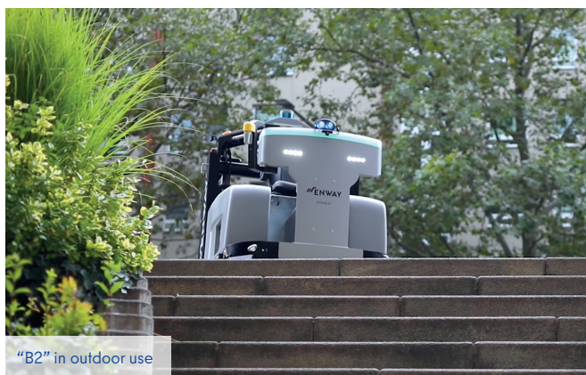
"B2" in outdoor use