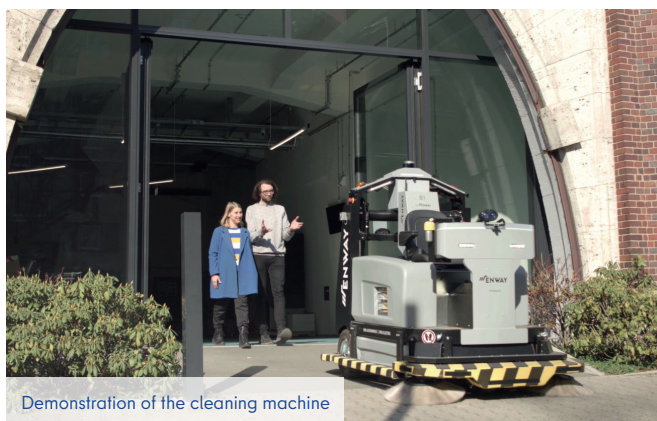
Demonstration of the cleaning machine

Editorial and design: ariadne an der spree GmbH