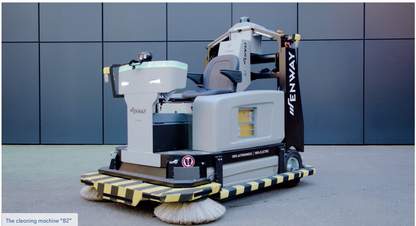
The cleaning machine “B2”