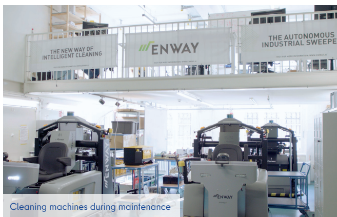
Cleaning machines during maintenance