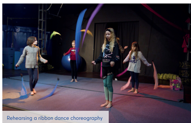
Rehearsing a ribbon dance choreography