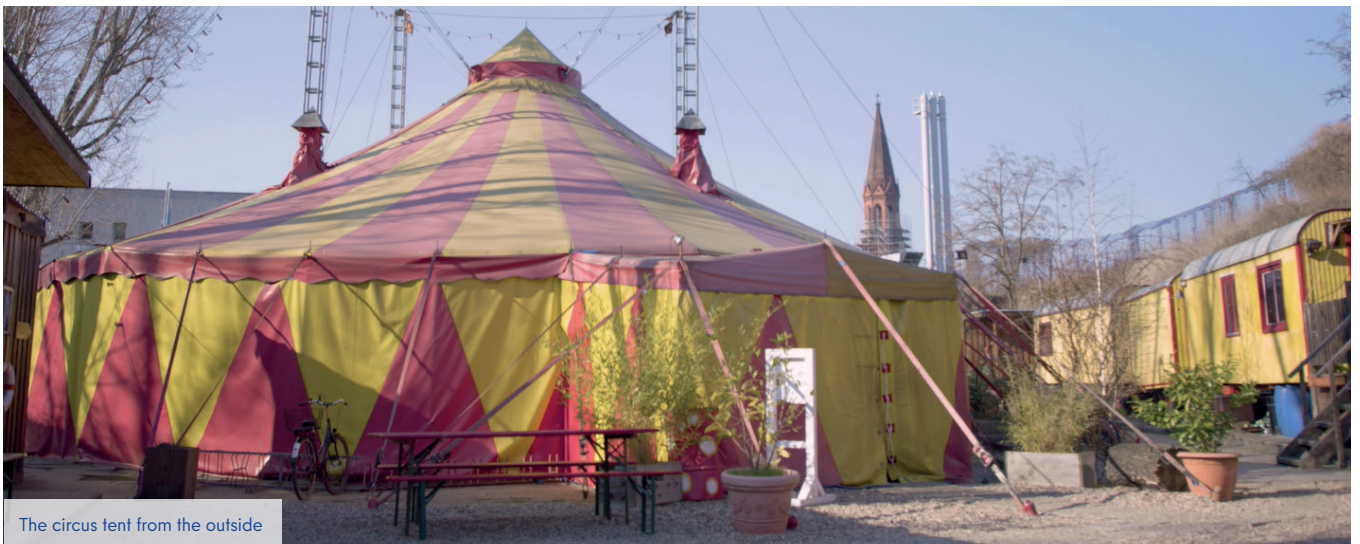
The circus tent from the outside

The European Regional Development Fund (ERDF) supports “CABUWAZI” as part of the “Future Initiative City District II”, thus providing children and young people with their families a protected place that they can help shape themselves.