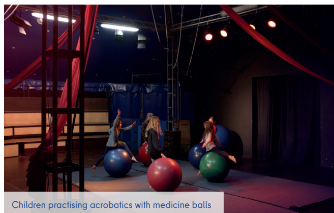
Children practising acrobatics with medicine balls

Editorial and design: ariadne an der spree GmbH