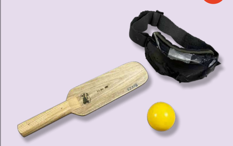
This "Showdown" set from the Berliner Blinden- und Sehbehindertensportverein (Berlin Athletic Club for the Blind and Partially Sighted) entered our collection one month ago. — Collection of the Sportmuseum Berlin