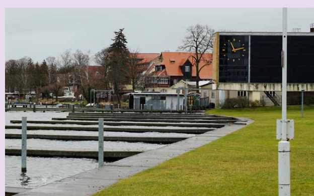
Sportmuseum Berlin, photo: M. Ganten, Grünauer Wassersportmuseum, photo: C. v. Steffelin