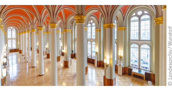
A view of the Hall of Pillars

The Golden Book, which is one of the city's visitors' books, is exhibited in a display case in the gallery, and documents visits made to Berlin by many distinguished guests. The members of the city council and the municipal assembly who were murdered under the National Socialist and Stalinist regimes are commemorated by a memorial plaque.