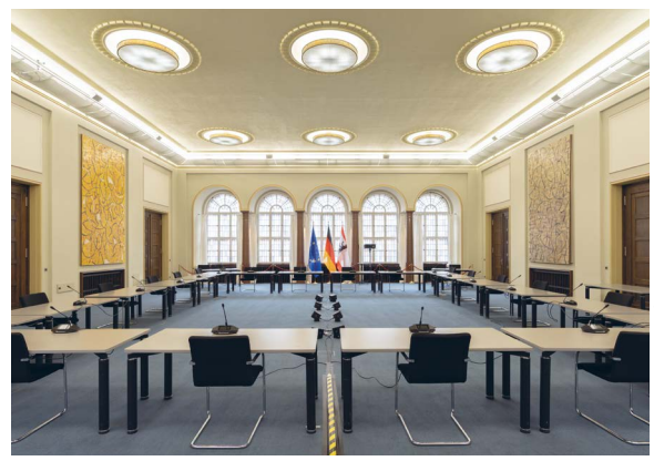
A look inside the Louise Schroeder Conference Room, formerly called the Green Hall due to its colour scheme

The panels on the front of the building on Rathausstraße show the bourgeoisie submitting to the elector Frederick II ('Iron Tooth') by giving him the keys to the city. The scene is followed by the construction of the Hohenzollerns' palace. Other reliefs honour the achievements of the Prussian monarchy and the city's industrial boom in the 19th century. The chronicle ends with German unification: in the last relief, Berliners celebrate the news from Versailles about the founding of the German empire.