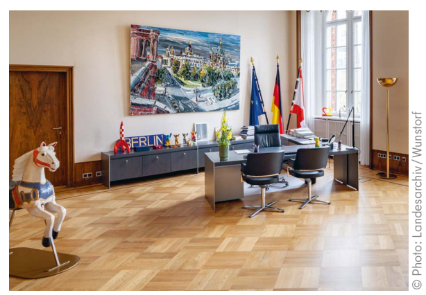
Office of the Governing Mayor