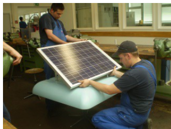
Trainees install the solar panel on rooftops