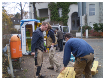
Carpenters install benches and the BookboXX itself