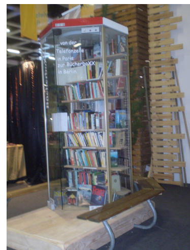
View on three BookboXXes as a result of the german-french cooperation.

Vocational expertise is very close connected with social and ecological sustainability.