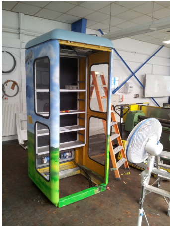
Trainees design the shelving with integrated lighting.

Various occupations and learning-centers can contribute by their specific focuses.