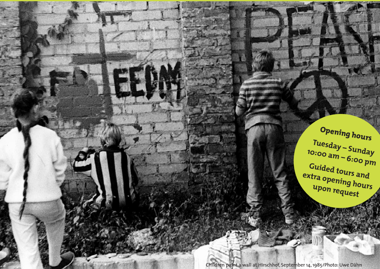
Children paint a wall at Hirschhof, September 14, 1985

f i @ MuseumPankow museumsek@ba-pankow.berlin.de 030-90295 3917