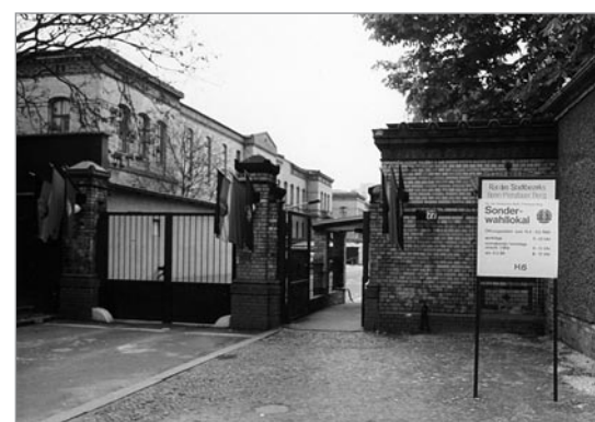
Entry Prenzlauer Allee, 1989

The site exemplifies the SED's use and abuse of power at the communal level, the local Prenzlauer Berg Round Table and the elections in 1990, as well as the reorganization of the borough administration and civic activism in the 1990s.