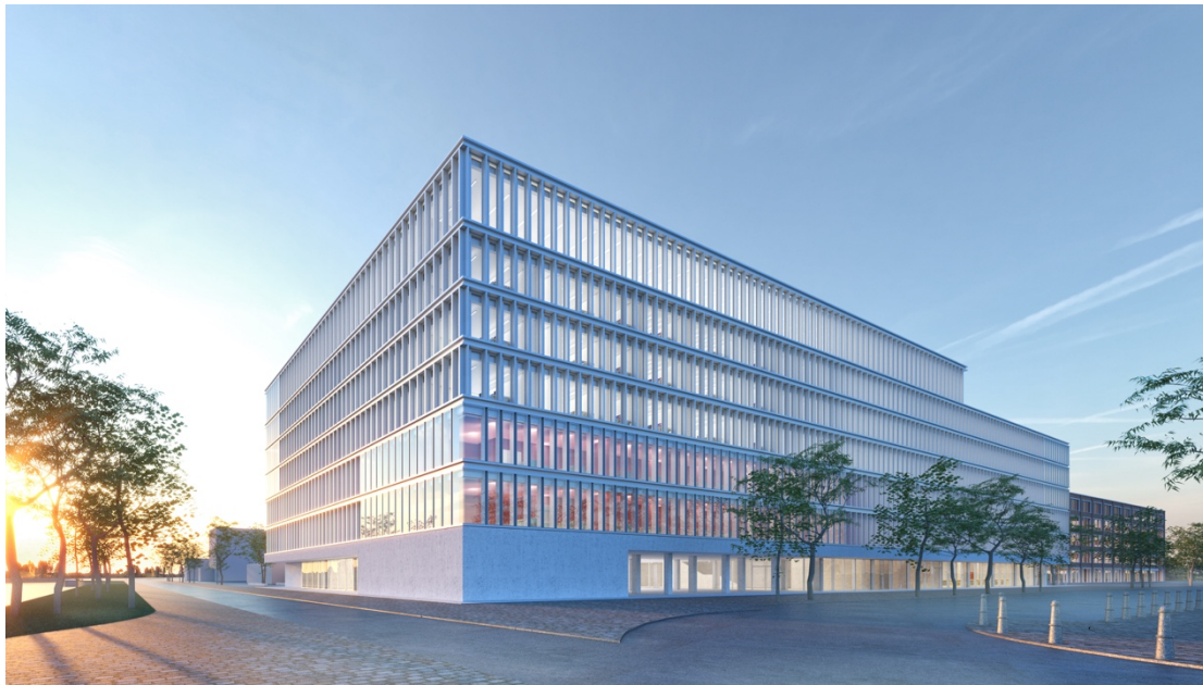
Illustration: New mathematics building (MATH) at dusk, perspective from north-west © Code Unique Architekten, Dresden

As a structural science, mathematics is the universal basis for all natural sciences and engineering. In its pure, logical language, it describes and proves scientific relationships precisely. Applied mathematics finds solutions to problems in industry, technology and society.