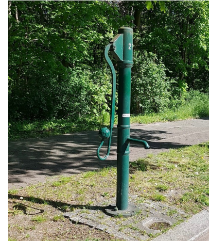
EMERGENCY WATER WELL