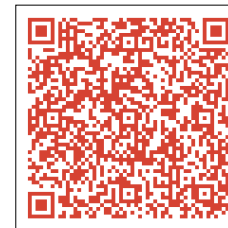
Kat-L und Kat-I Standorte

In addition to the district office's emergency power-supplied disaster control lighthouses (Kat-L), disaster control information points (Kat-I) are set up at other locations in the event of an emergency. An overview of all locations is available on the Internet.