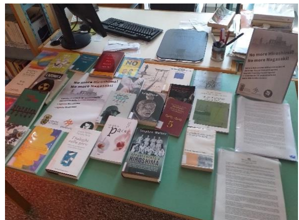
Printed "Peace Declarations" were distributed at the City Library