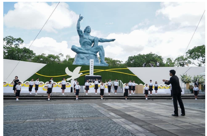
Peace Memorial Ceremony of Nagasaki