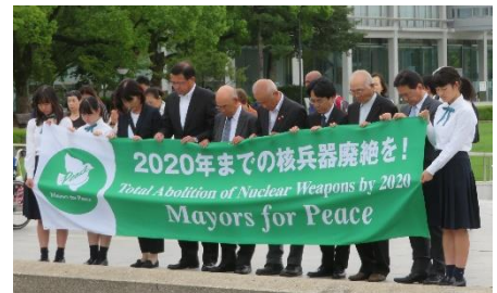
Event to mark the IDP 2019 in Hiroshima

Mayors for Peace has been a long-time supporter of the IDP and encourages all member cities to commemorate the International Day of Peace on September 21. In accordance with these initiatives, the City of Takayama, Japan, a member city of Mayors for Peace, will organize a Peace Bell Ceremony where like-minded bell owners in the city, such as temples and churches, will sound their bells in unison at noon on the IDP. Furthermore, the mayor of Takayama City requests our member cities to do the same at noon in their own local times, in order to offer as many people as possible an opportunity to renew their determination to bring peace to the globe.